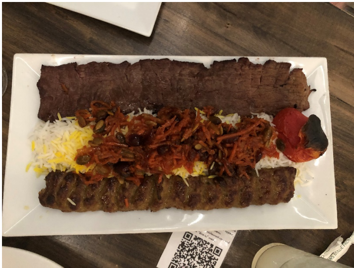
10. Favorite food to order at Iranian restaurant ...Shirin Polo with Kabob – Iranian friends gathering