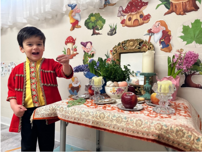
5. Celebrating Norouz at school, welcoming spring and preparing the decoration.