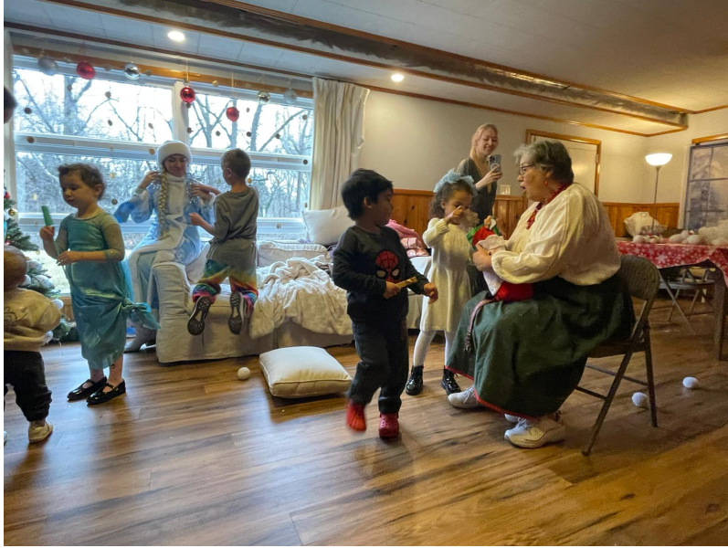
1 Attending Russian Christmas Workshop, learning songs and folklore dance