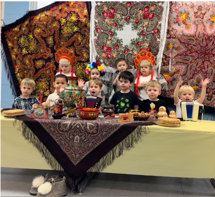
4 Celebrating Maslenitsa, an ancient Slavic tradition to celebrate spring and ending winter.