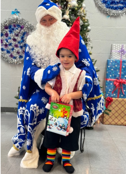
3 Russian Orthodox Santa came to visit the classroom at Metaphor Russian School