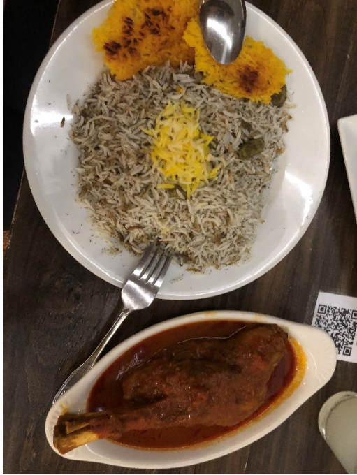
9. Attending an Iranian gathering in an Iranian restaurant