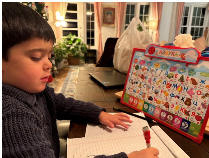
8. Working on Russian homework - Pre-writing exercises