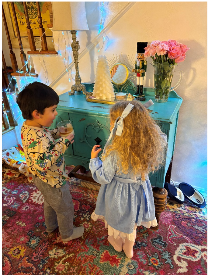
2 Hosting a friend from Moscow over the Holiday season