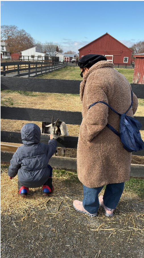
6. Grandma came to visit for the month of November and December from Iran.